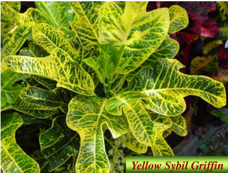
Yellow Sybil Griffin